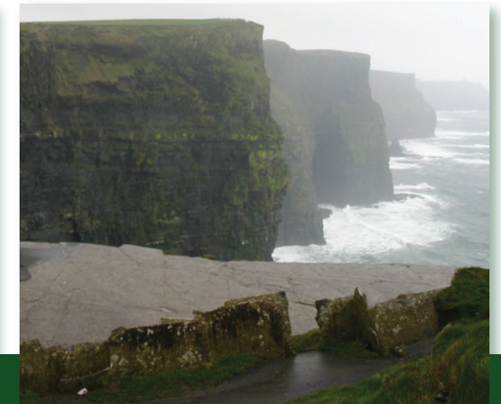
The Cliffs of Moher, County Clare