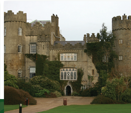
Malahide Castle, County Dublin