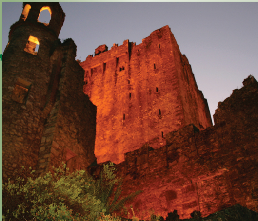
Blarney Castle, County Cork