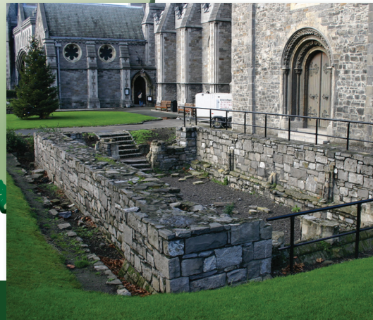
Christ Church Cathedral Dublin